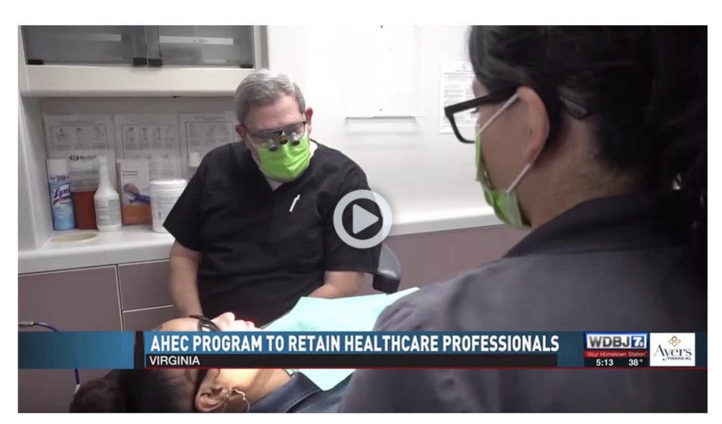
Virginia AHEC program to retain healthcare professionals in underserved areas: <a href="https://www.wdbj7.com/2024/10/18/virginia-ahec-program-retain-healthcare-professionals-underserved-areas/">www.wdbj7.com/2024/10/18/virginia-ahec-program-retain-healthcare-professionals-underserved-areas/</a>