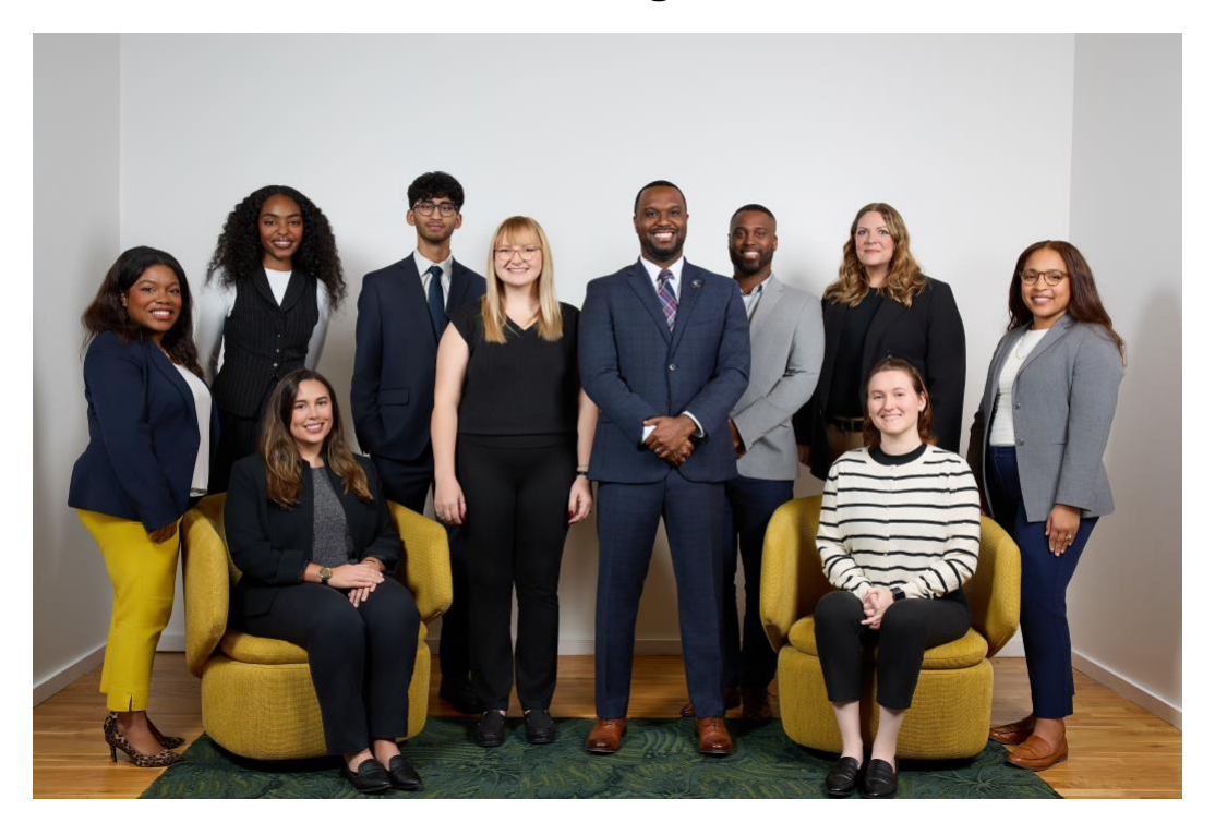
Thank you for reviewing VHWDA's Biennial Report. Please visit vhwda.org for me information.